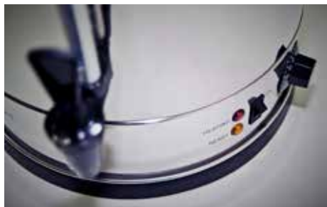
Indicator lights for practicality

Available in 3 sizes for whichever event you're organising.