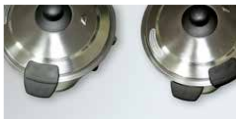
Lockable lid for added safety